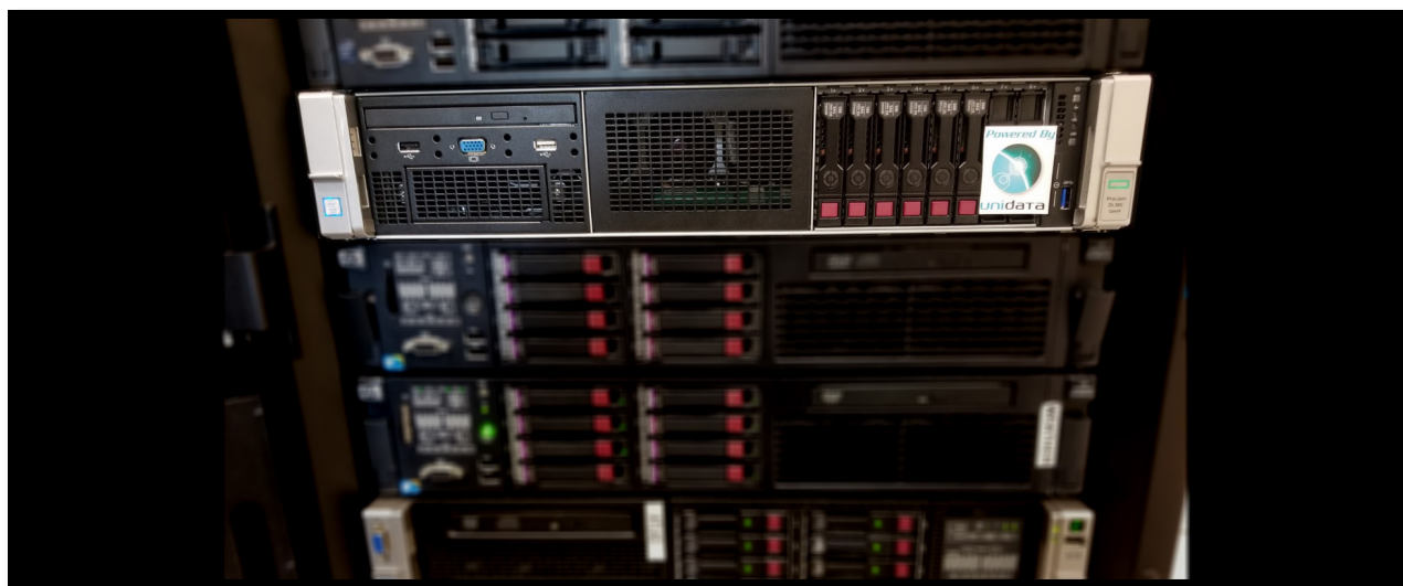
Figure 1. The server in the rack shortly after it had arrived at the college

This award has allowed us to purchase a HPE DL380 Gen9 rack server, which was installed during the fall of 2017. This server contains two Intel Xeon E5-2697 processors for a total of 72 logical processing cores, 256GB RAM, two 400GB solid state drives and four 600GB 15K SAS hard drives (detailed specifications shown in Table 1). The server is located in the college's climate-controlled server room, which uses redundant generator-backed power, and is staffed & monitored 24/7 by the college's IT department.